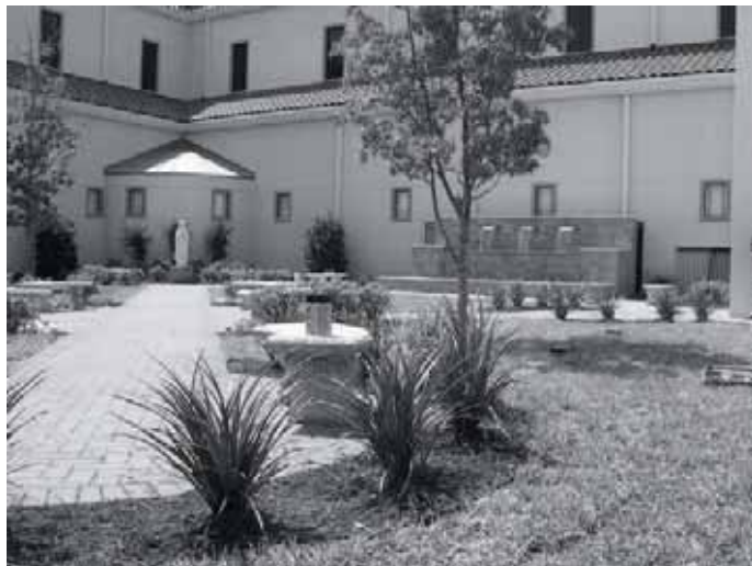
Children's Prayer Garden

The project was funded through 2004 carnival proceeds, donations from individuals and parish groups, and the sale of memorial pavestones. Donations are still being accepted. To purchase a pavestone or make a donation, contact Jennifer Lindsey at (972) 393-5544 ext. 1104 .