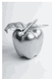
Stewardship of Talent