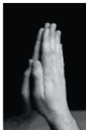
Stewardship of Time