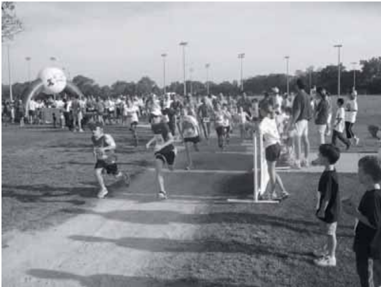
April 17, 2005—“They’re OFF!!!” at the Allison Hendry Faith & Family Fun Run .