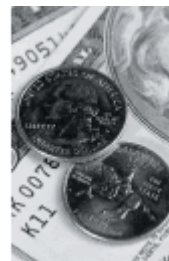
Stewardship of Finances