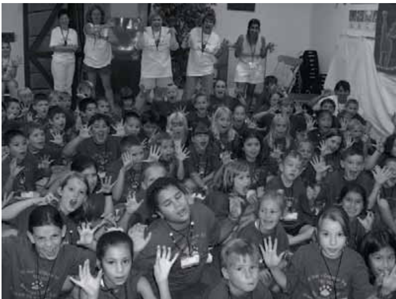
July 11 thru 15, 2005—The Vacation Bible Schoolers (“VBSers”) roar “WOW” to show they are “Wild about God!”