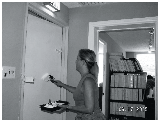
A St. Ann volunteer paints a door at The White Rose Center.

One of Respect Life’s newest volunteer efforts involves “labor of love for the unborn” at The White Rose Center. Every third Saturday of the month from 8 to noon, volunteers help with vacuuming, cleaning, sorting clothes, and data entry at the pro-life women’s clinic.