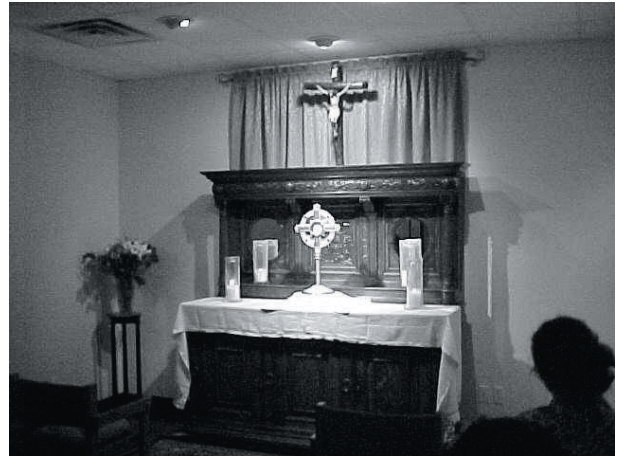
September 2005—The Perpetual Eucharistic Adoration (PEA) chapel, located in the St. Ann shopping center. St. Ann’s PEA program was moved from the St. Kilian’s Chapel to their new location this past summer.