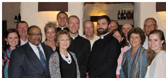
The new deacons with the St Ann group that made the trip