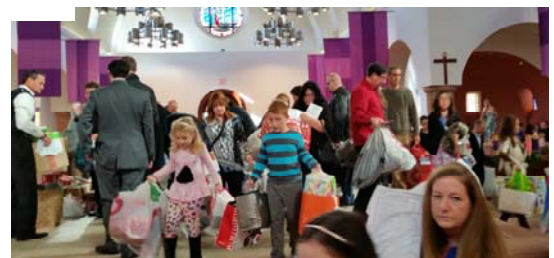
Parishioners helping with Magi gifts