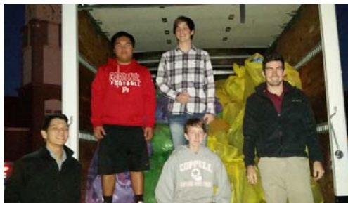
HSM helping load Magi gifts