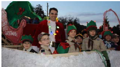
Pack 820 elves @ Coppell Christmas Parade