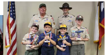
Pinewood Derby Winners