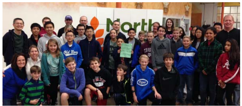
Annual SAY Christmas Break Service Day. Close to 100 people (inc. parents & family members) gave their time to serve at the North Texas Food Bank.