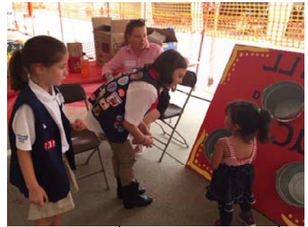
AHG girls helping at the Carnival

Among many activities we do, we participate annually in St. Ann’s Fall Carnival by helping out in Kiddie Land and providing the color guard for the opening flag ceremony of the Carnival. We are also super excited to bake and serve desserts for the Fish Fry on March 18, 2016.