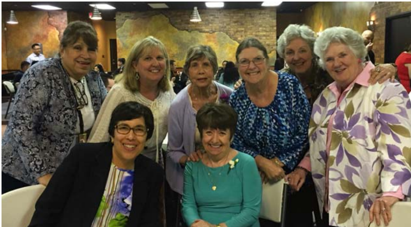
Celebrating with the New Initiate in the Catholic Church