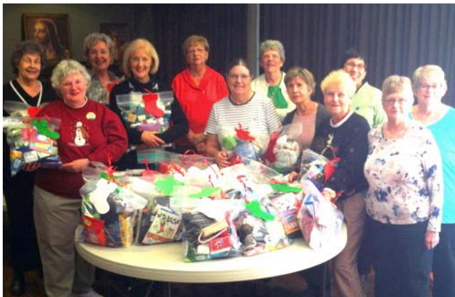
Presents for Homeless Under the Bridge